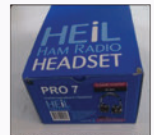
PRO 7 Heil Headset 2 w/ microphone (Paid $300 — New condition. )