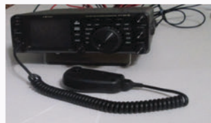
YAESU FT991A Radio 1.8—430 bands and MANUAL. (Paid $995.00)— New condition