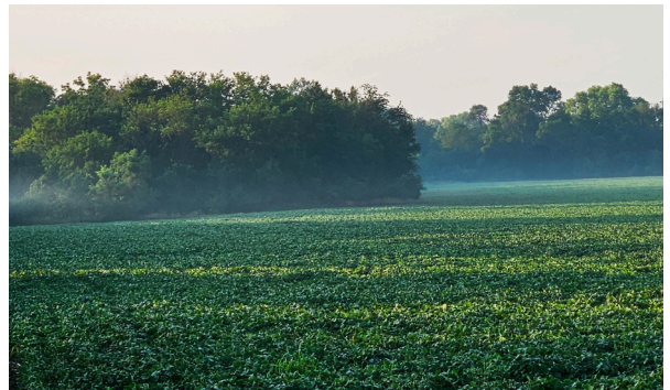
Morning mist en route to 2024 CSG