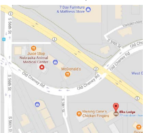
Elks Lodge #80, 5910 S 58th St, Lincoln

There is no need to RSVP. There will be plenty of food for everyone! We look forward to seeing you there.